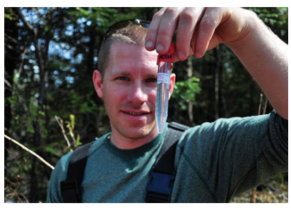
Pheromone washings are used to bait traps

No tools currently exist to efficiently capture or divert newly metamorphosed, downstream-migrating juvenile sea lampreys. Drift nets and screw traps can be used as assessment devices. Ongoing research has revealed when downstream migration occurs, where juveniles are located in the water column, and what sensory cues influence their behavior while moving downstream. These new tools may also be ready for field testing within the next ten years as supplemental controls.